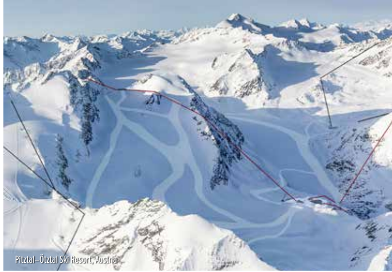
Pitztal–Ötztal Ski Resort, Austria