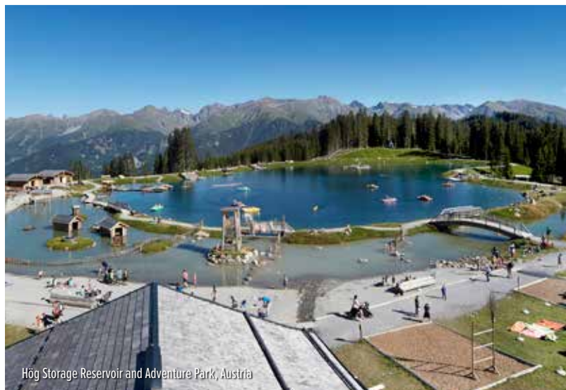
Hög Storage Reservoir and Adventure Park, Austria