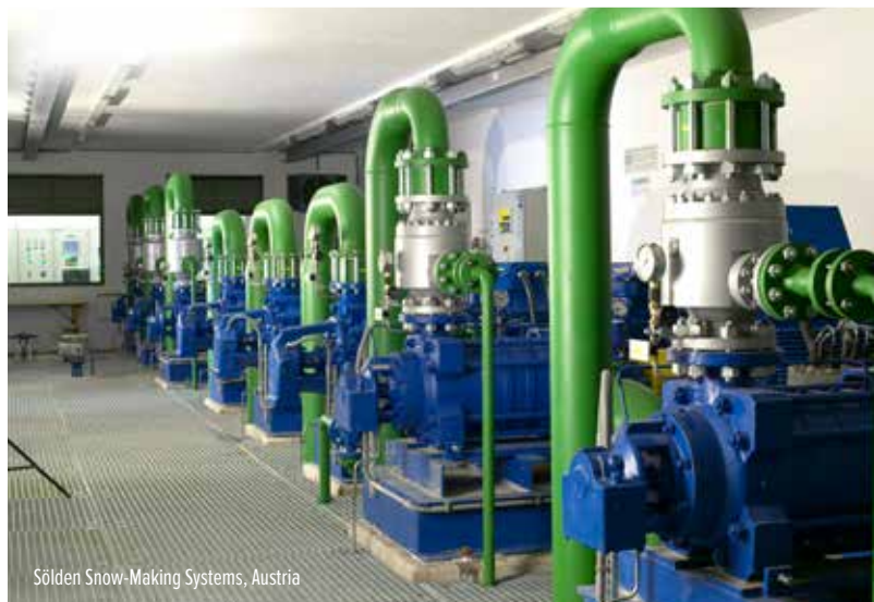
Sölden Snow-Making Systems, Austria