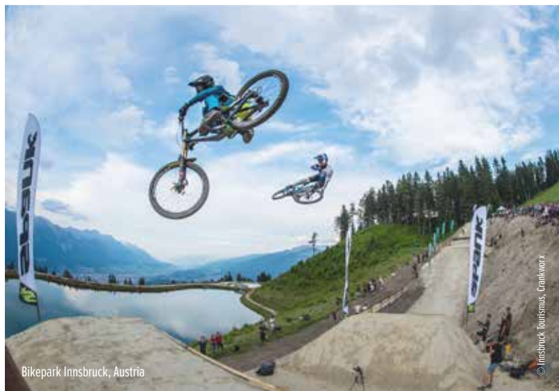
Bikepark Innsbruck, Austria