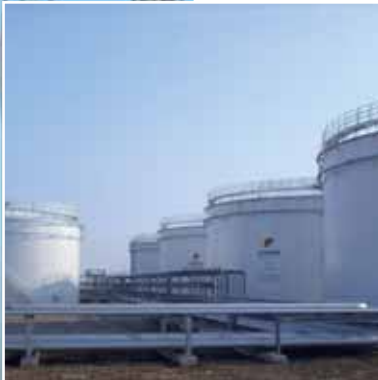
Storage depot, Romania