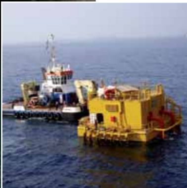
SPM Fujairah, UAE