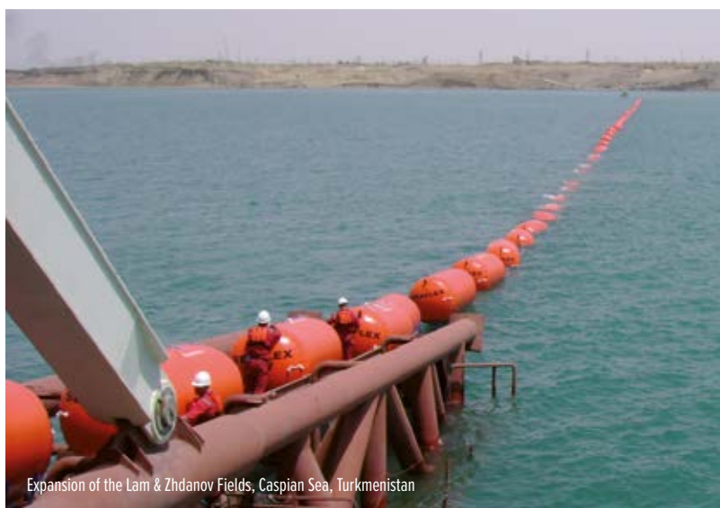
Expansion of the Lam & Zhdanov Fields, Caspian Sea, Turkmenistan