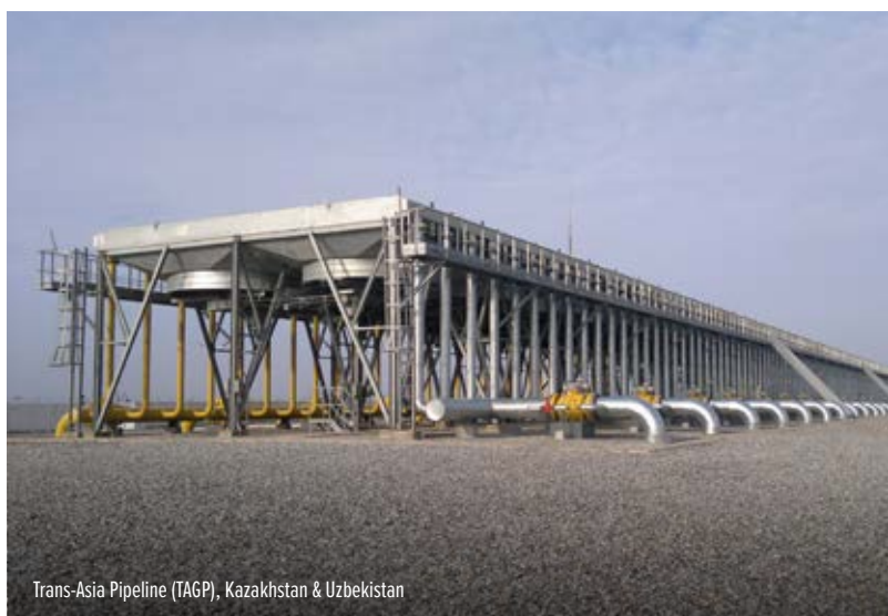
Trans-Asia Pipeline (TAGP), Kazakhstan & Uzbekistan