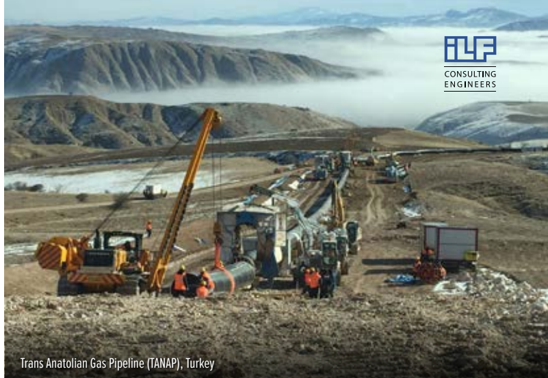
Trans Anatolian Gas Pipeline (TANAP), Turkey