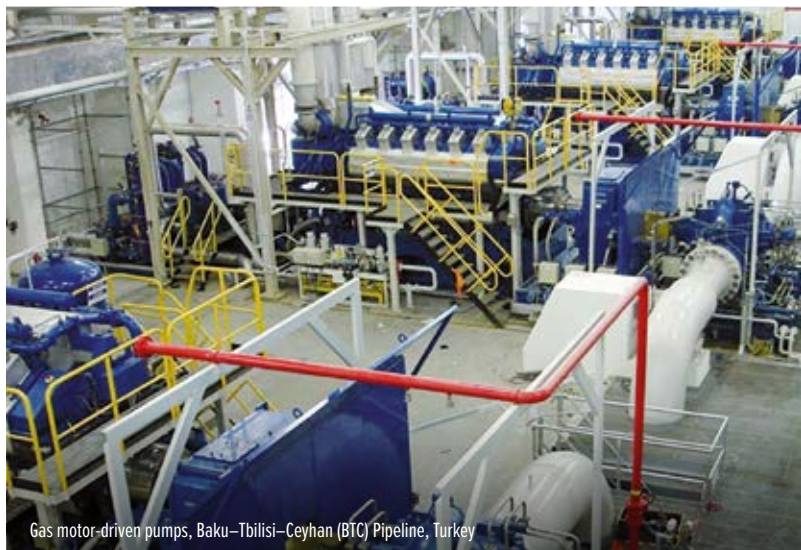
Gas motor-driven pumps, Baku–Tbilisi–Ceyhan (BTC) Pipeline, Turkey