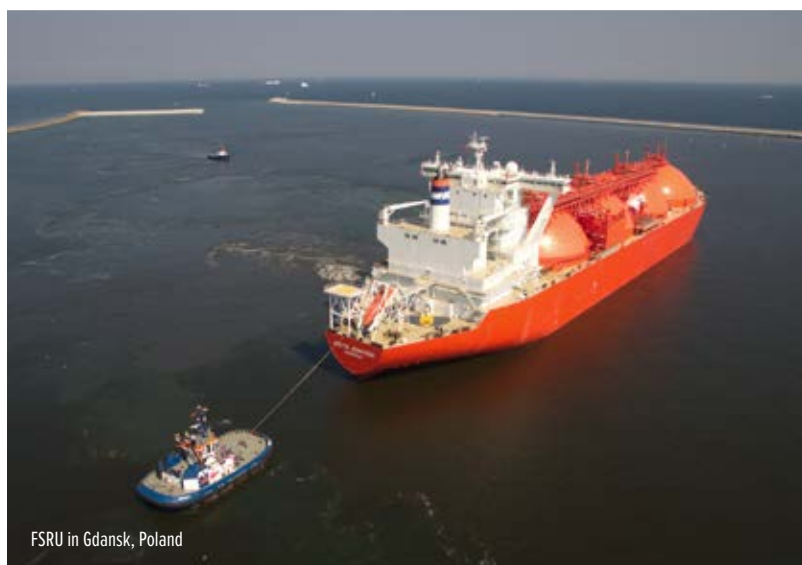
FSRU in Gdansk, Poland