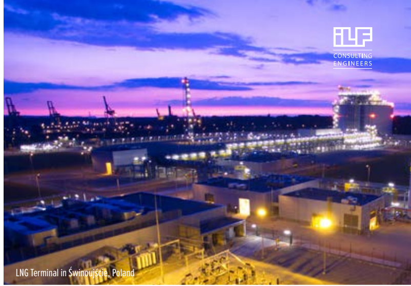
LNG Terminal in Świnoujście, Poland