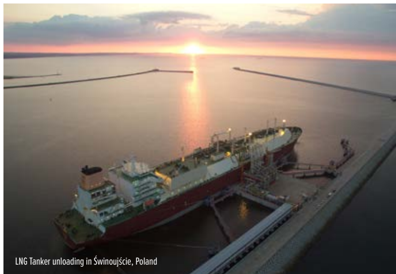
LNG Tanker unloading in Świnoujście, Poland