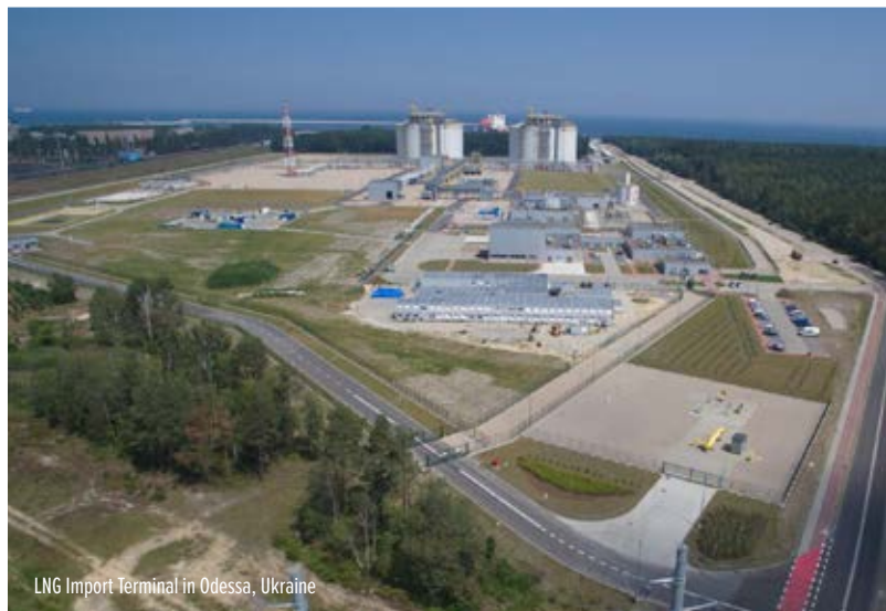
LNG Import Terminal in Odessa, Ukraine