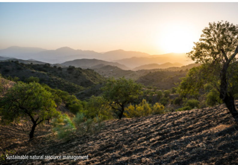
Sustainable natural resource management