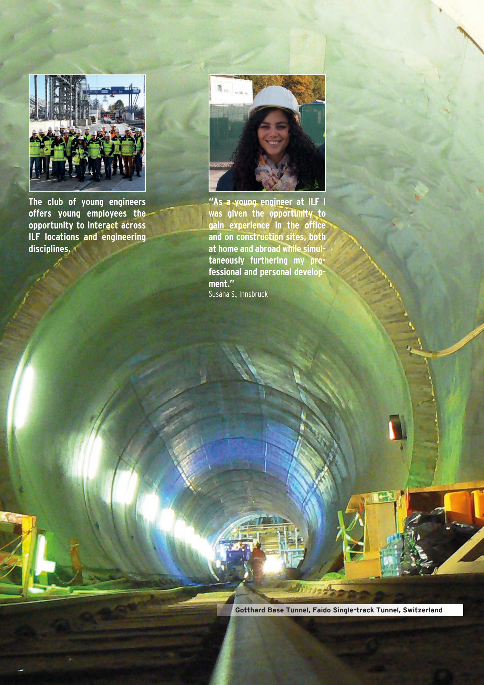
Gotthard Base Tunnel, Faido Single-track Tunnel, Switzerland