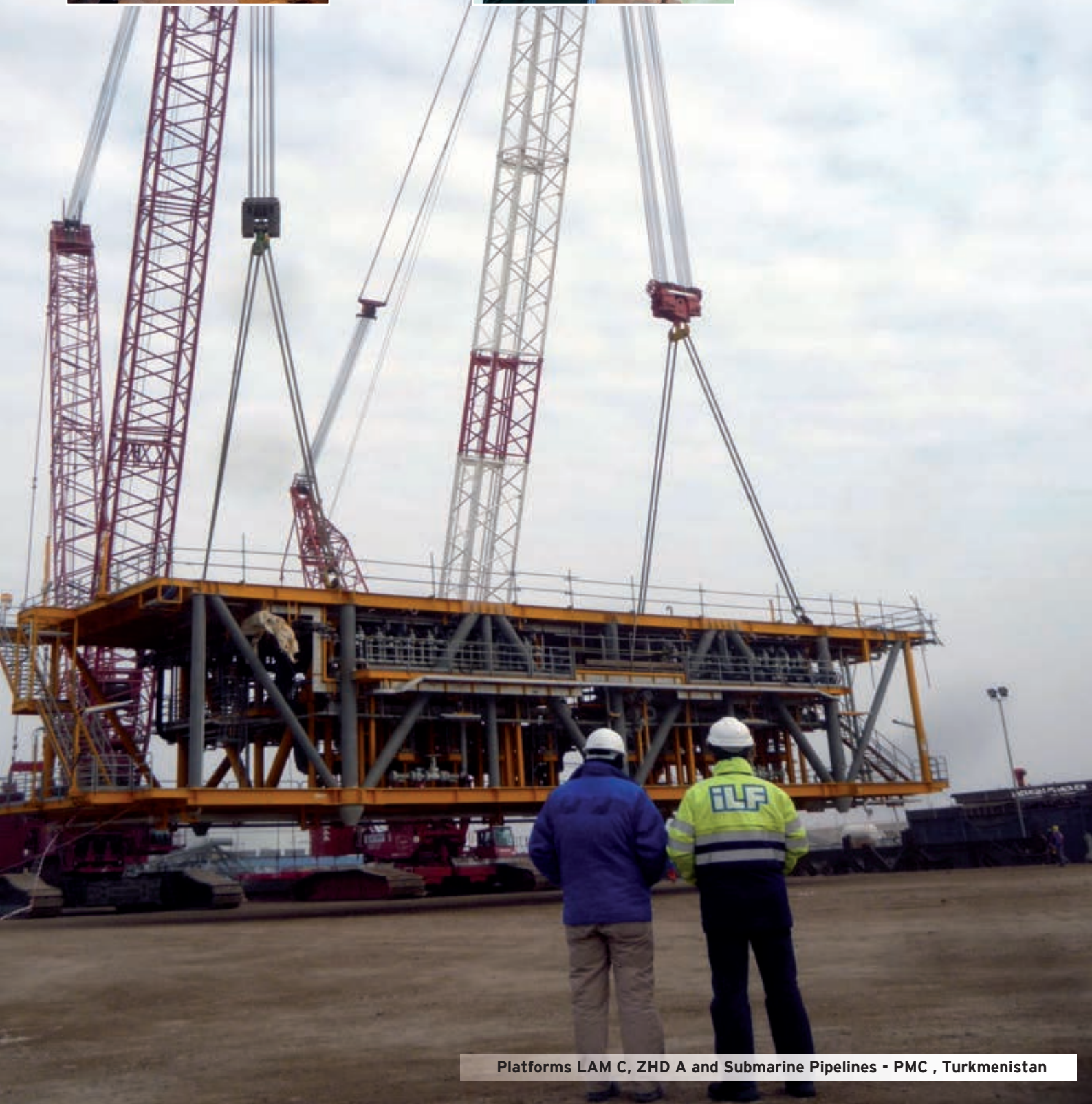
Platforms LAM C, ZHD A and Submarine Pipelines - PMC , Turkmenistan