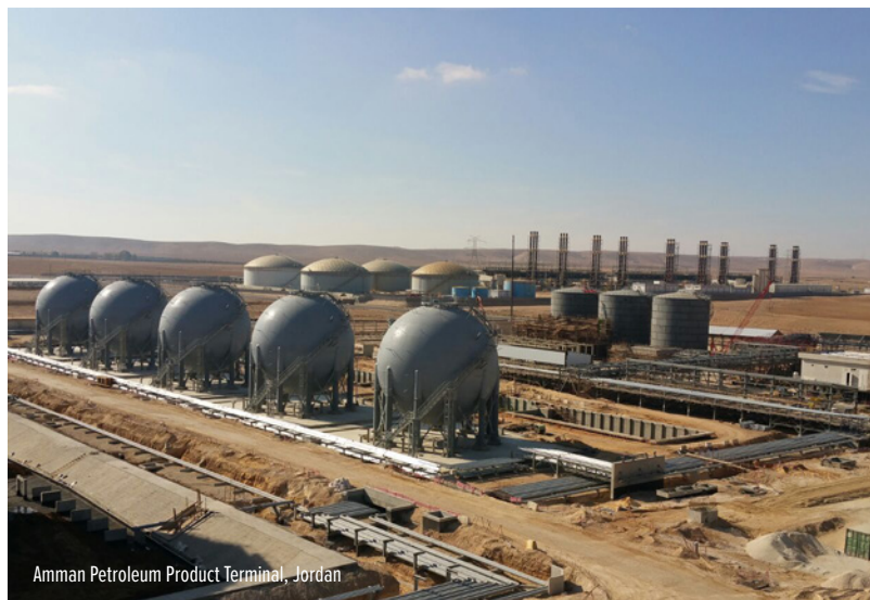
Amman Petroleum Product Terminal, Jordan