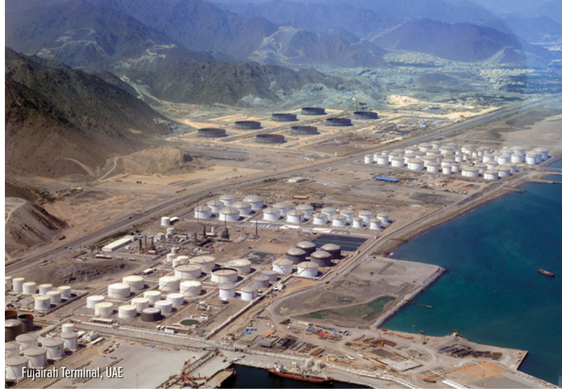
Fujairah Terminal, UAE