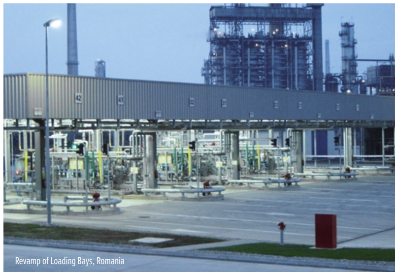
Revamp of Loading Bays, Romania