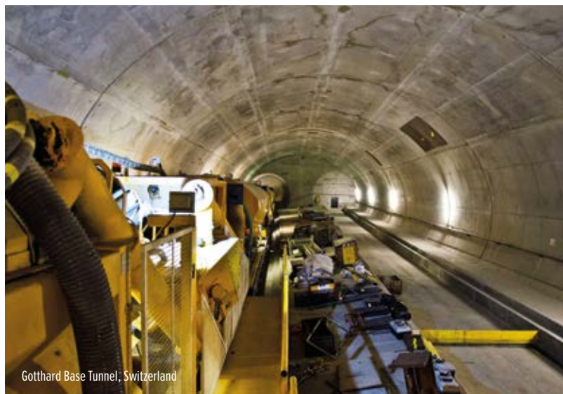
Gotthard Base Tunnel, Switzerland