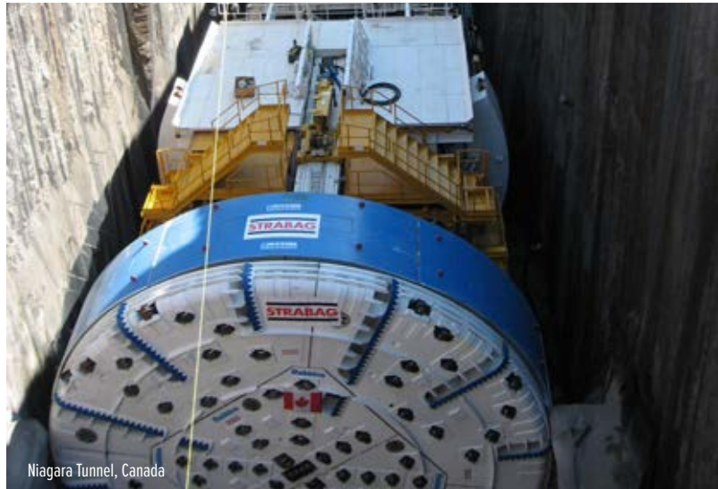
Niagara Tunnel, Canada