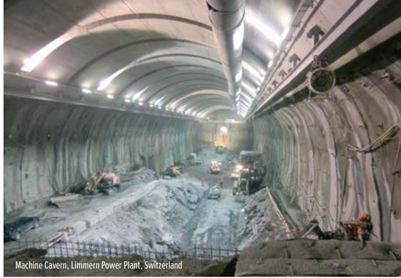
Machine Cavern, Limmern Power Plant, Switzerland