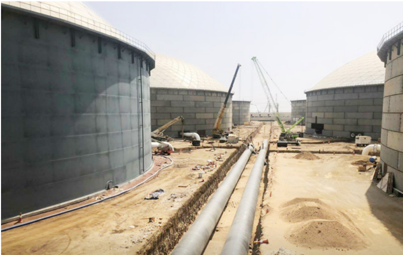
Tank farm, steel tanks: 170,000 m<sup>3</sup>, 2 pipelines of 96" (2,438 mm) each