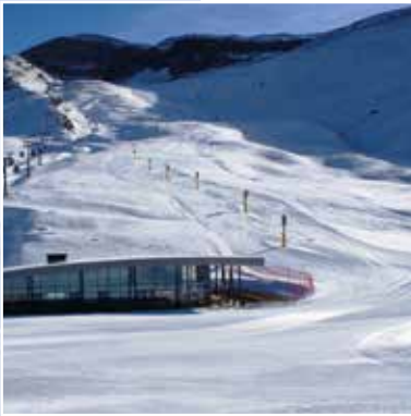
Shahdag, tourism complex, Azerbaijan