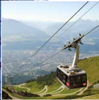
Innsbruck, New Nordketten ropeway, Austria