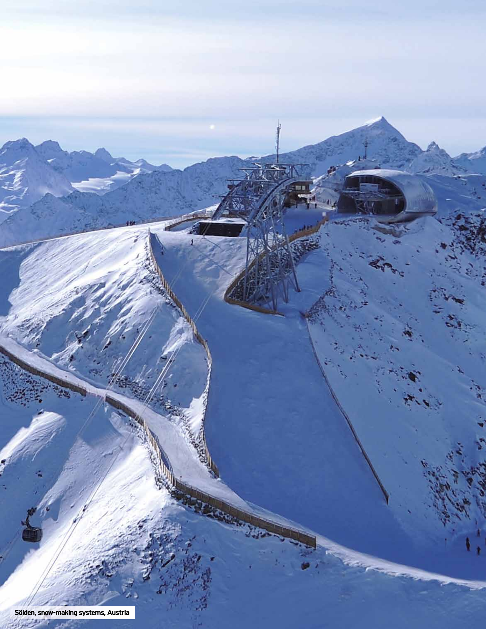
Sölden, snow-making systems, Austria